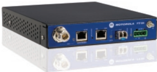
Compact Modem Unit